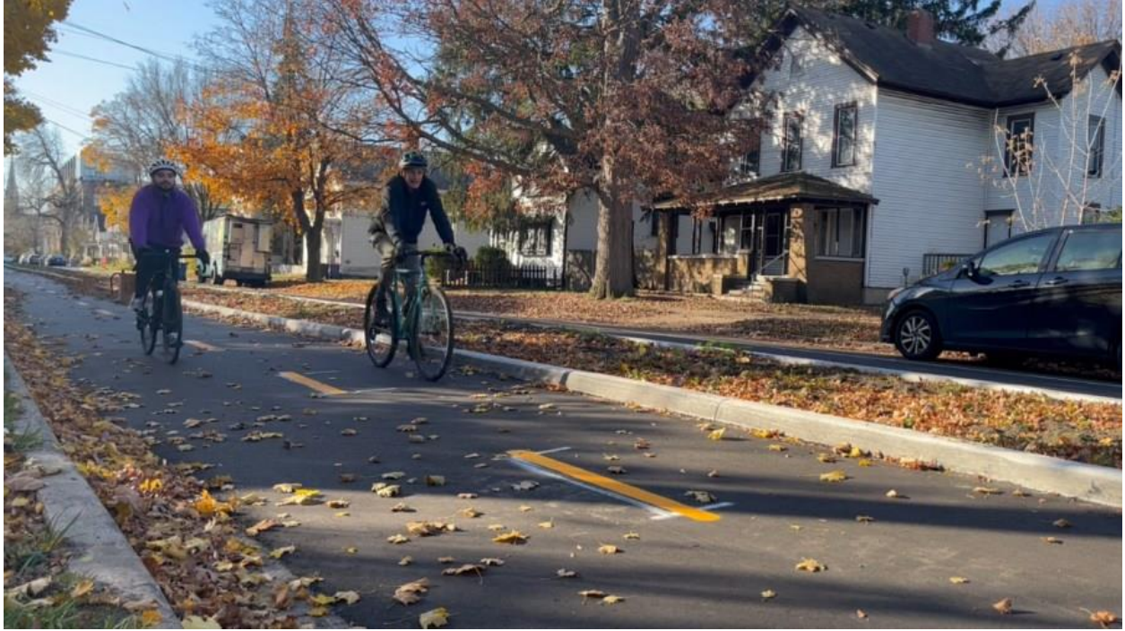
Ann Arbor bike lanes: image courtesy of Mlive: